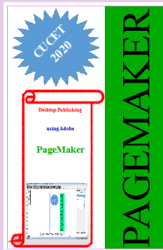
Figure 2: Poster creation on A4 page layout with help of Adobe PageMaker 7.0